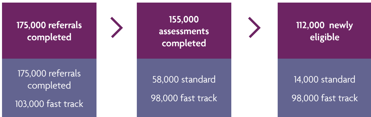
Figure 3: NHS CHC eligibility 2019-20

In 2019-20, there were 3,327 with reviews of eligibility completed by CCGs, 4.6% of the total referrals (though these are not directly related as the reviews may be for decisions made in previous years). Of these, 588 (18%) resulted in eligibility.